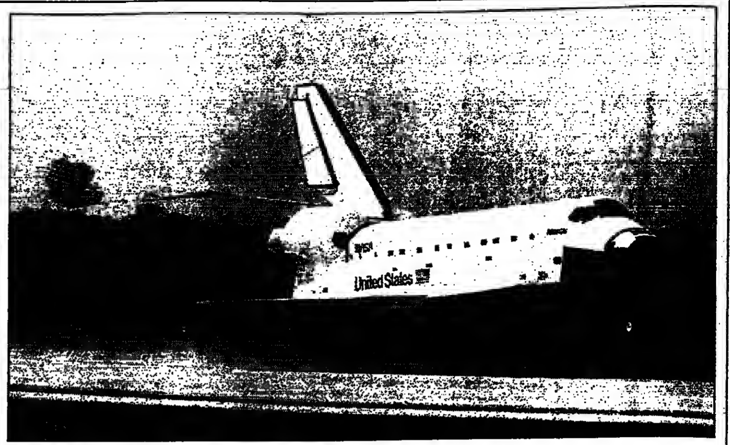
The space shuttle Atlantis lands at Cape Canaveral yesterday.

street and then burned the church. "That means it's been going on for 24 hours," he said pointing to the smoke still rising from the ruins. Only one wall of the wooden church was left standing. Residents said six other churches had been looted or stoned. The flames from the Batak church spread to a residential area behind the building which the caretaker - who refused to give his name - said housed some 500 families. Flimsy shacks vanished in the blaze, while a three-storey apartment block was gutted. The homes closest to the church belonged to Chinese, who are a frequent target of rioting Moslem mobs in Indonesia. Moslem homes lying further back were also destroyed. A Chinese woman sifting through the debris of her home said perhaps the Moslems were jealous of Chinese wealth.